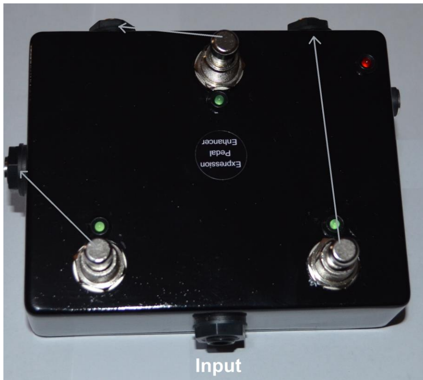
Figure 2 – Top view